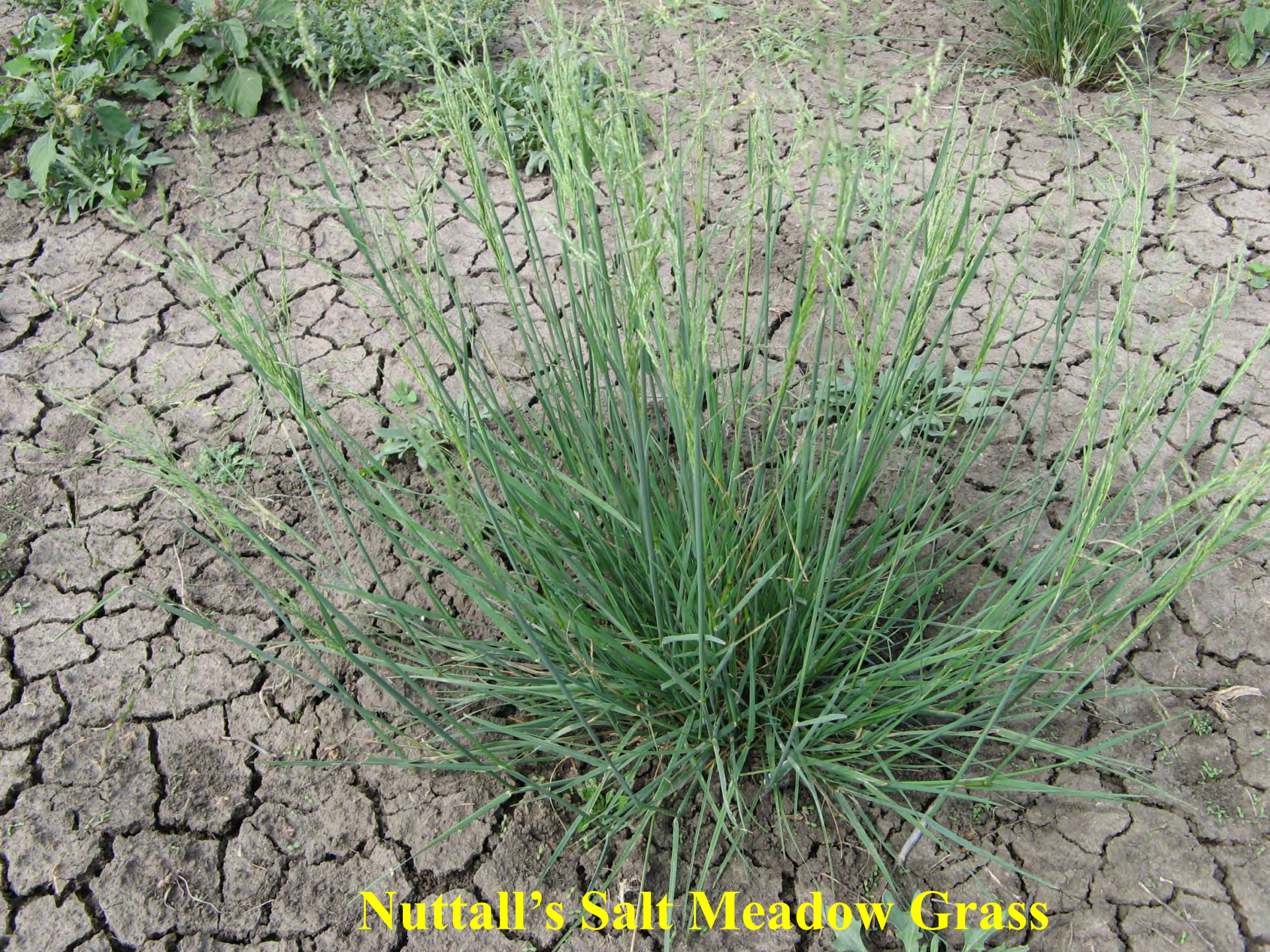
Nuttall's Salt Meadow Grass