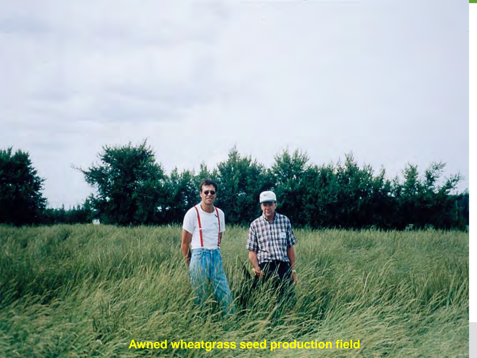
Awned wheatgrass seed production field