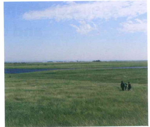
A prairie landscape at Moose Creek Red Angus.

SK PCAP will host the 2018 Native Prairie Restoration and Reclamation Workshop (NPRRW) in Saskatoon, SK on February 7 and 8, 2018 at the Saskatoon Inn. The