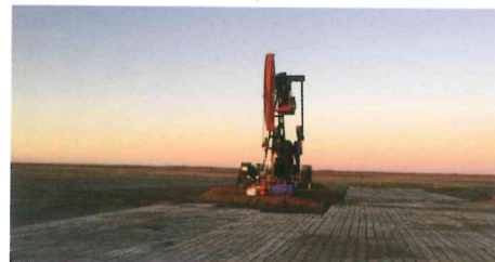
Minimal disturbance drilling sometimes includes the use of matting when on prairie.